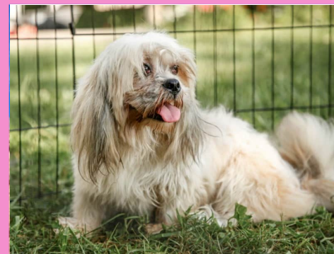
Jessiebelle (Lhasa Apso)