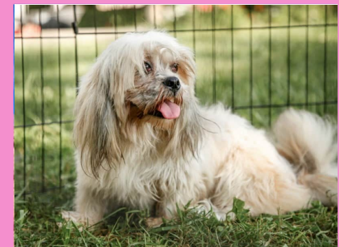
Jessiebelle (Lhasa Apso)