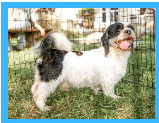
Charlie (Lhasa Apso)