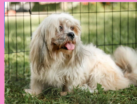
Jessiebelle (Lhasa Apso)