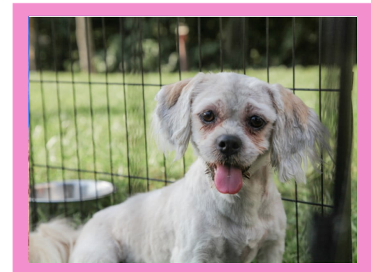
Lorelei (Lhasa Apso)