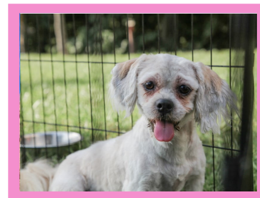
Lorelei (Lhasa Apso)