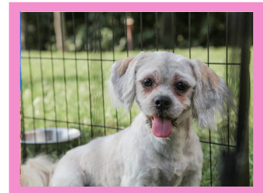
Lorelei (Lhasa Apso)