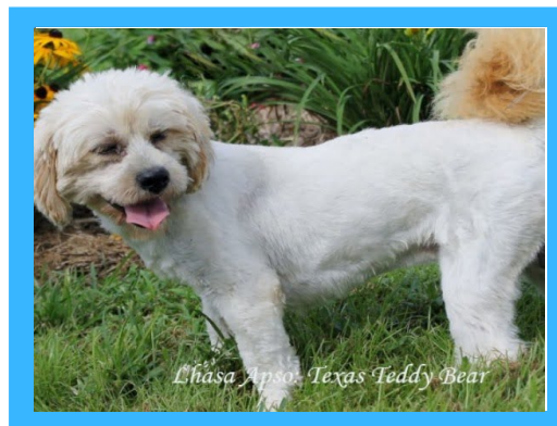
Texas (Lhasa Apso)