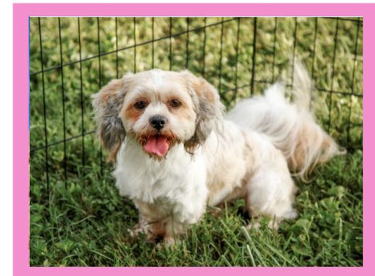
Tiffany (Lhasa Apso)