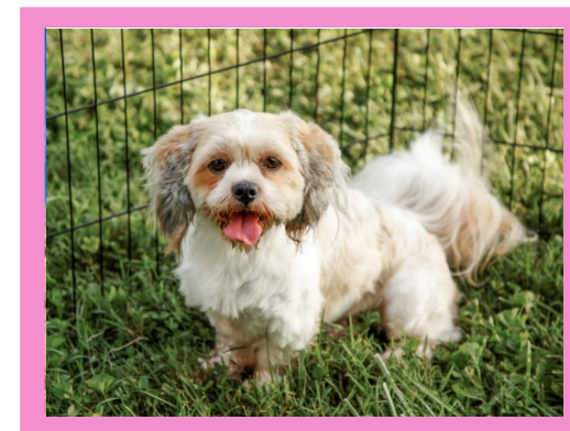
Tiffany (Lhasa Apso)